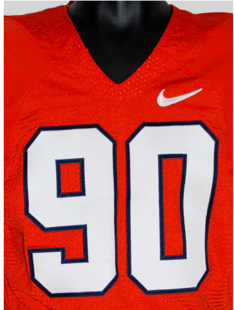
Throwback Jersey – 2008