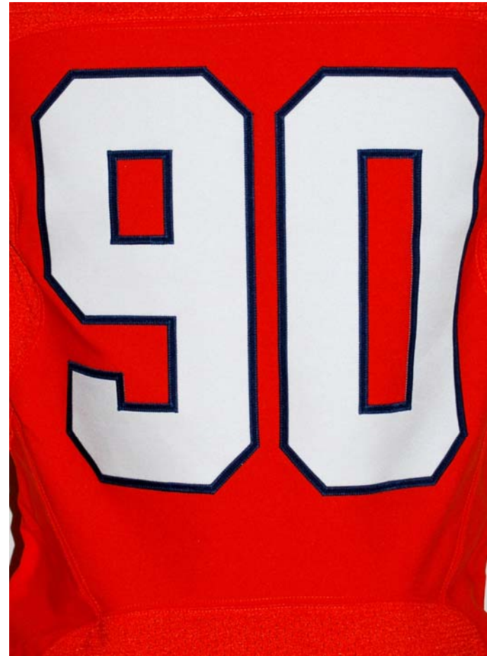
Throwback Jersey – 2008