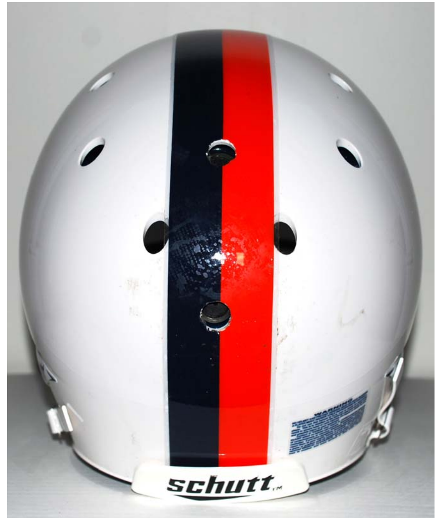
Throwback Helmet – 2008