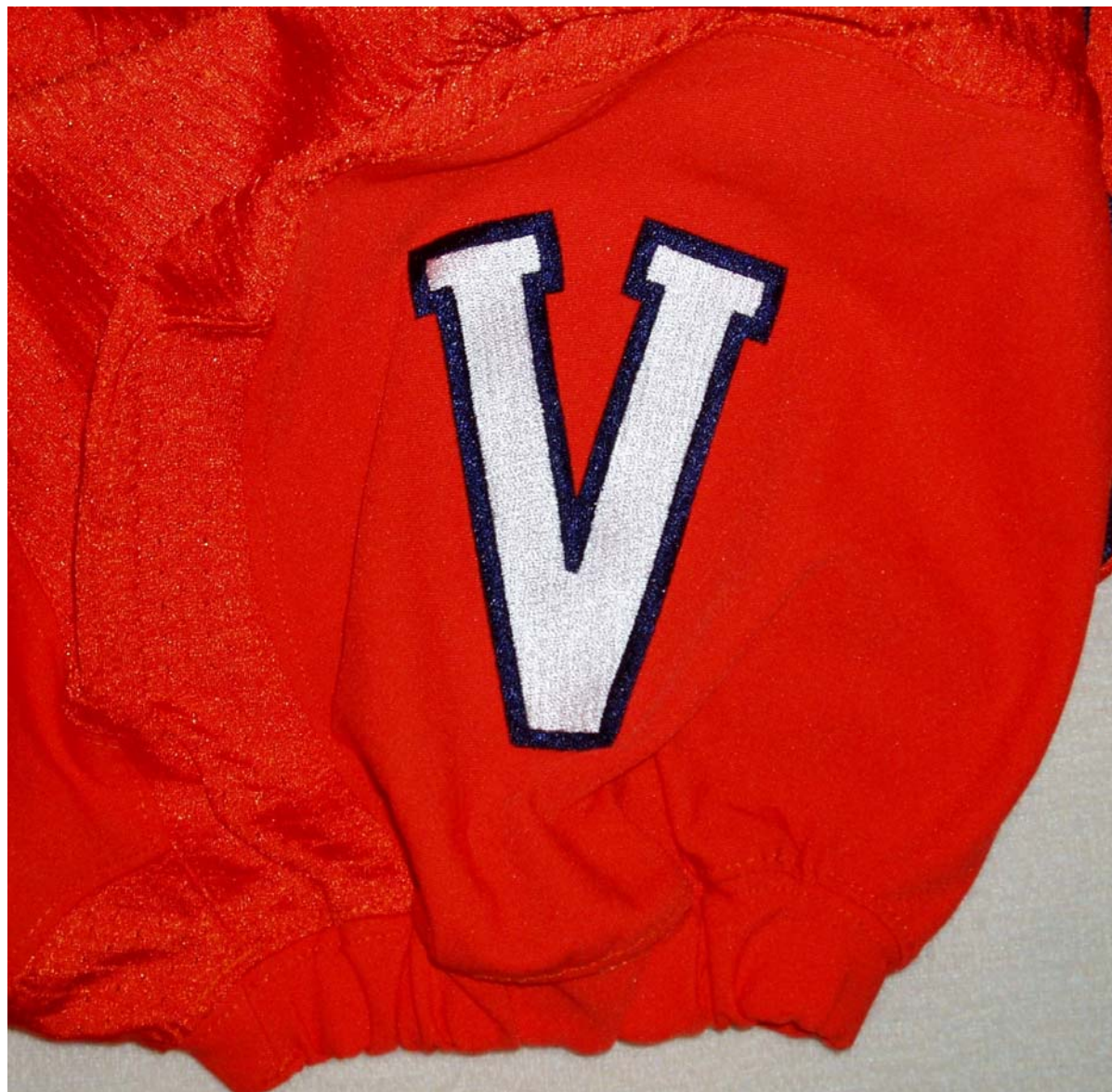
Throwback Jersey, Fig. 3: Shoulder / sleeve