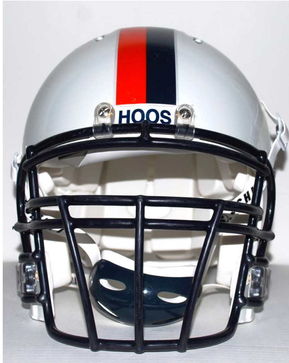
Throwback Helmet, Fig. 1: Front view