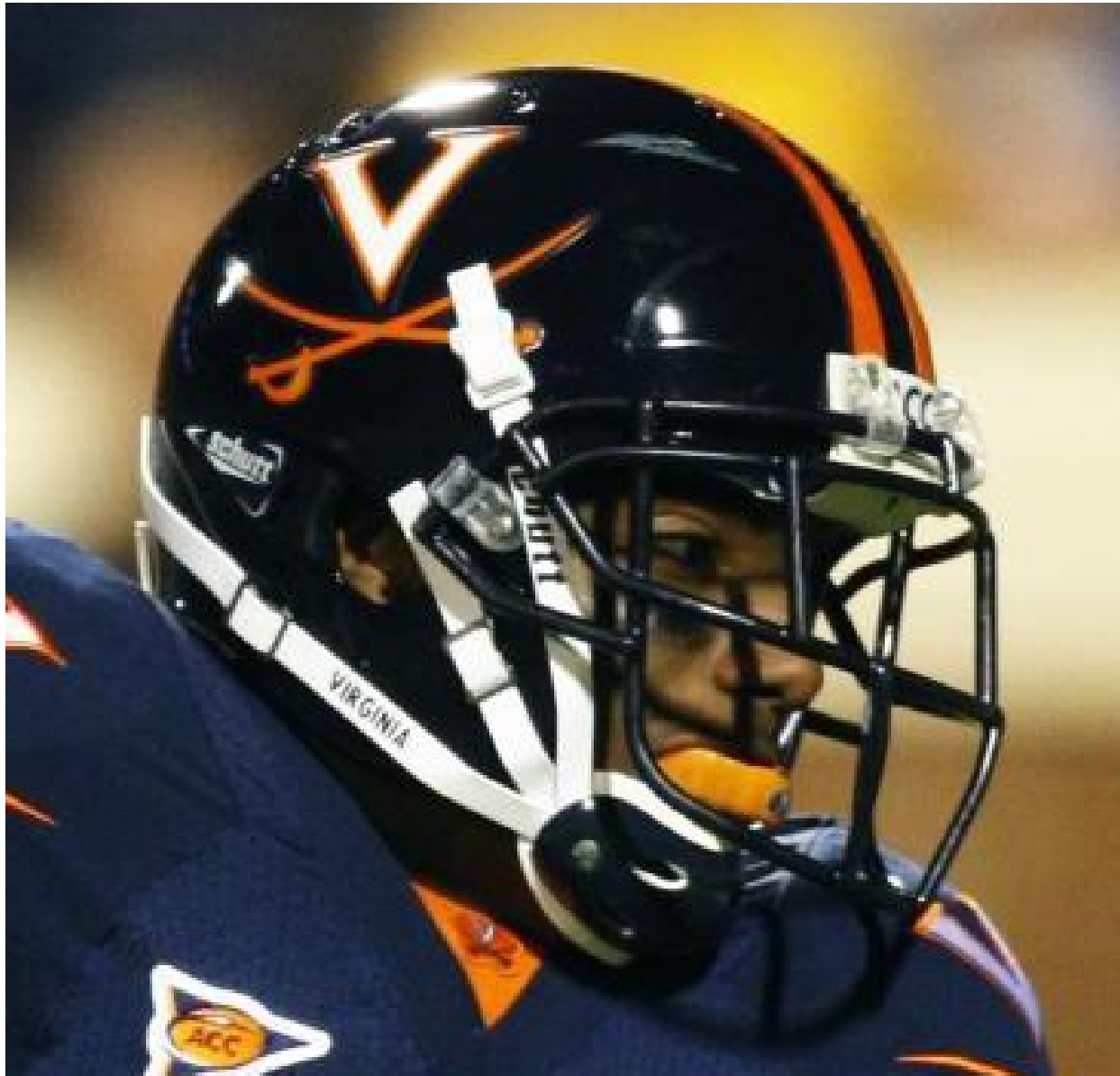
Helmet, Fig. 2a: Side view (right)