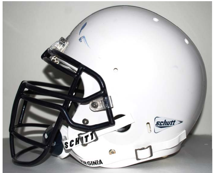
Throwback Helmet – 2008