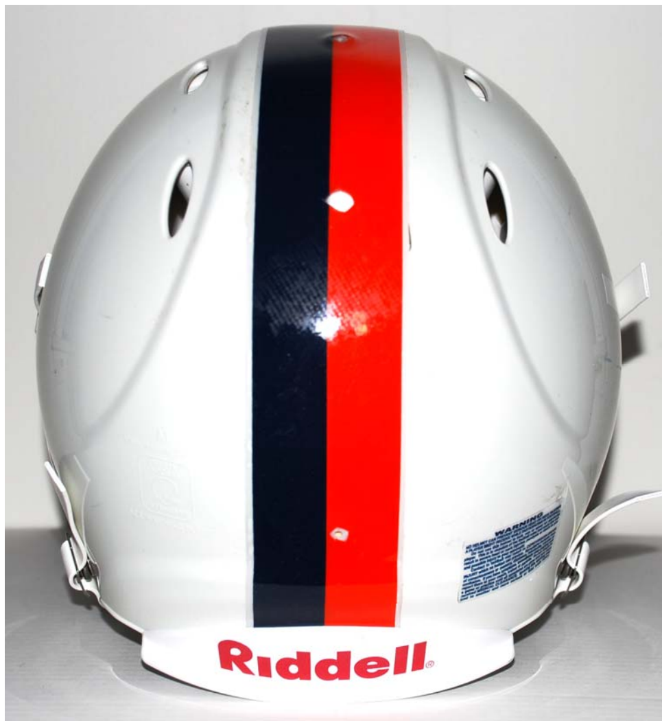
Throwback Helmet – 2008