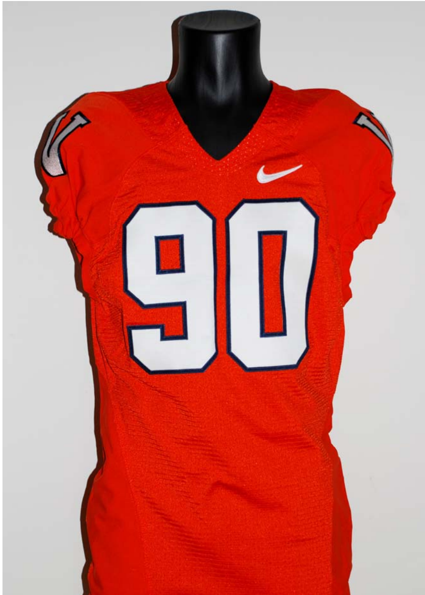
Throwback Jersey, Fig. 1: Front view