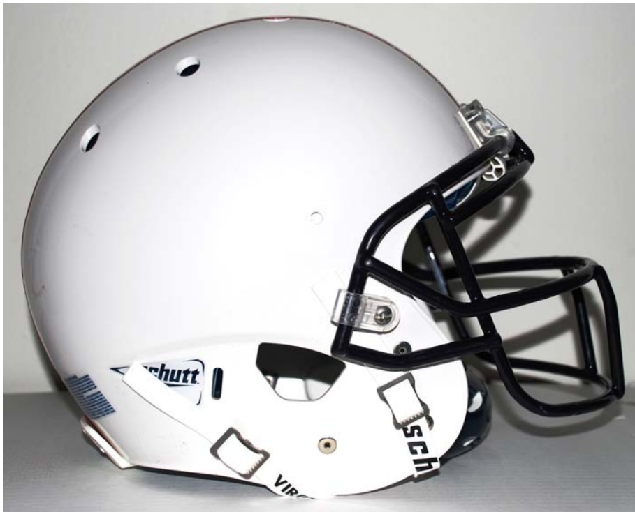
Throwback Helmet, Fig. 2a: Side view (Schutt helmet)