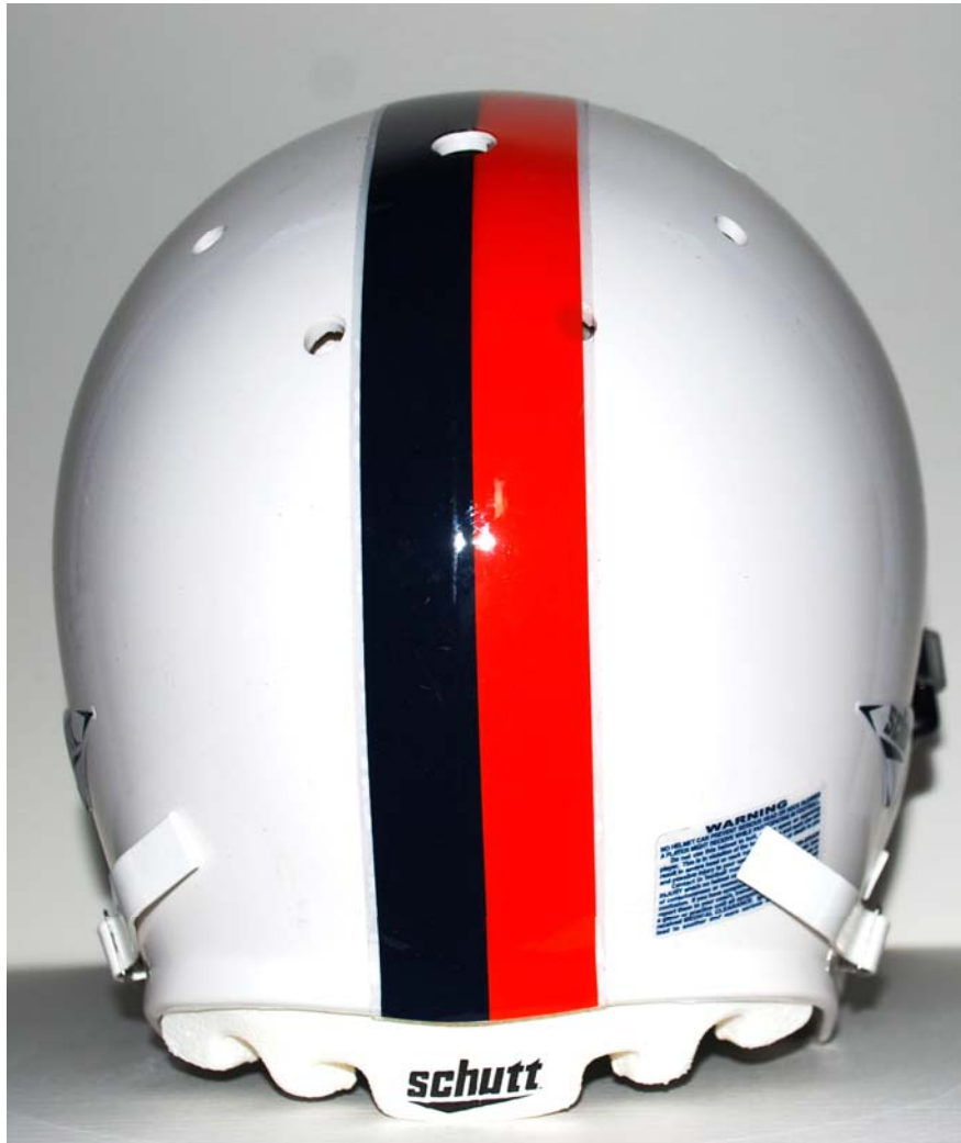
Throwback Helmet, Fig. 3a: Rear view (Schutt helmet)