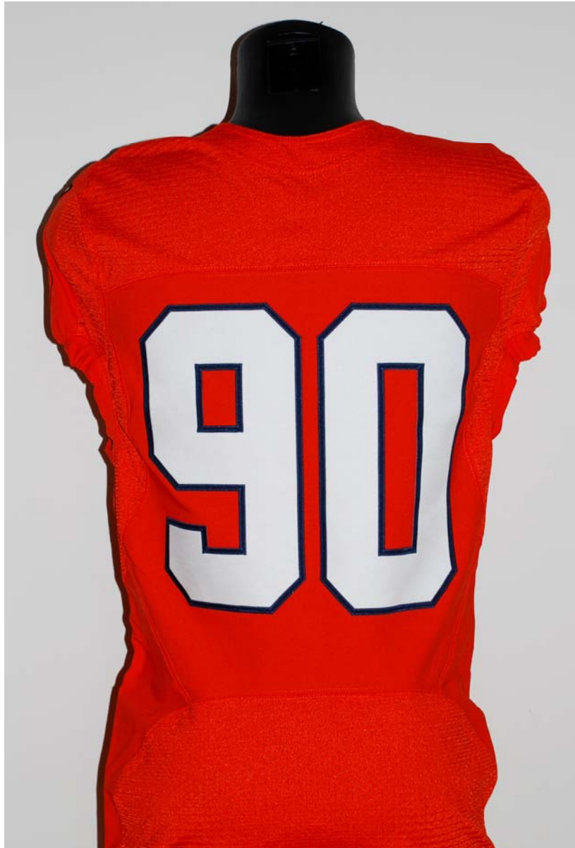
Throwback Jersey, Fig. 2: Rear view