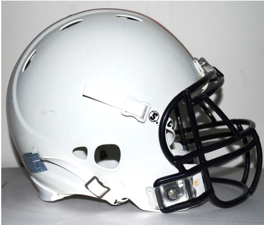
Throwback Helmet, Fig. 2b: Side view (Riddell helmet)