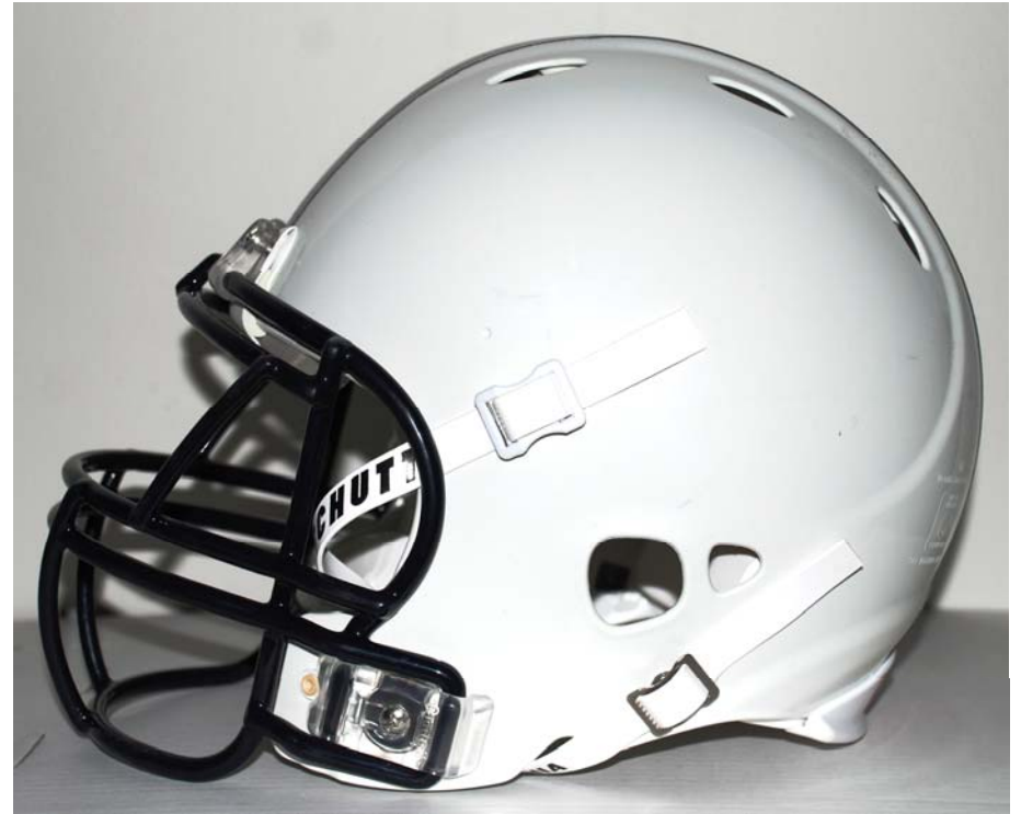
Throwback Helmet – 2008