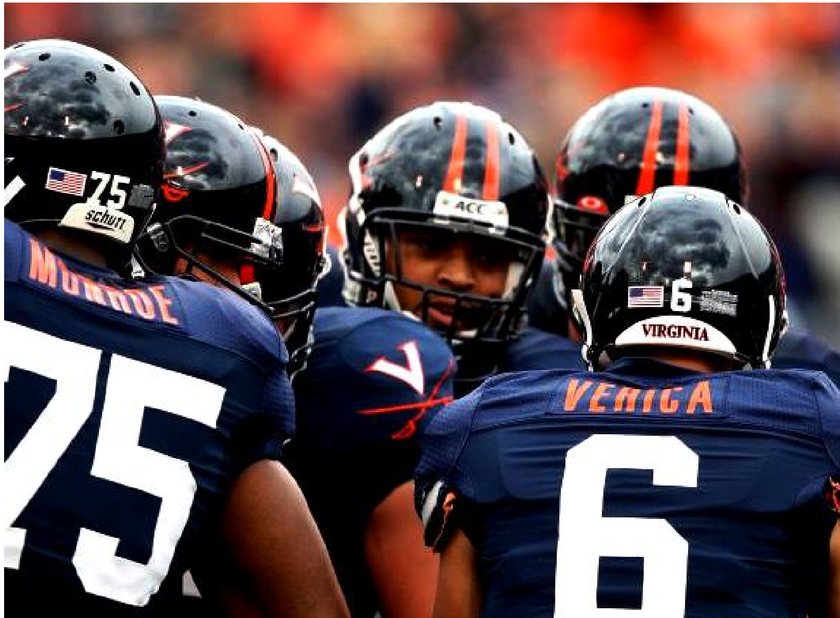
Helmet, Fig. 3: Rear view