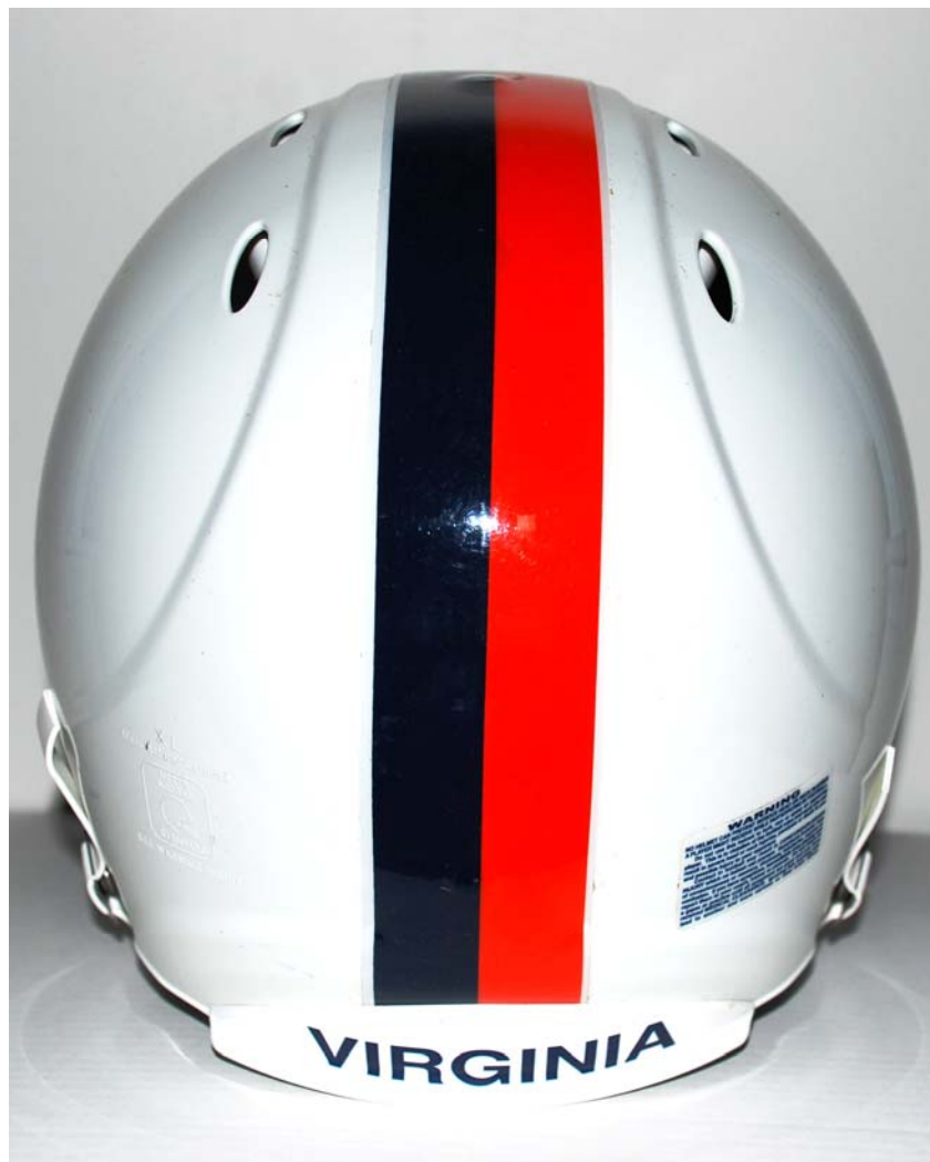
Throwback Helmet, Fig. 3b: Rear view (Riddell helmet)