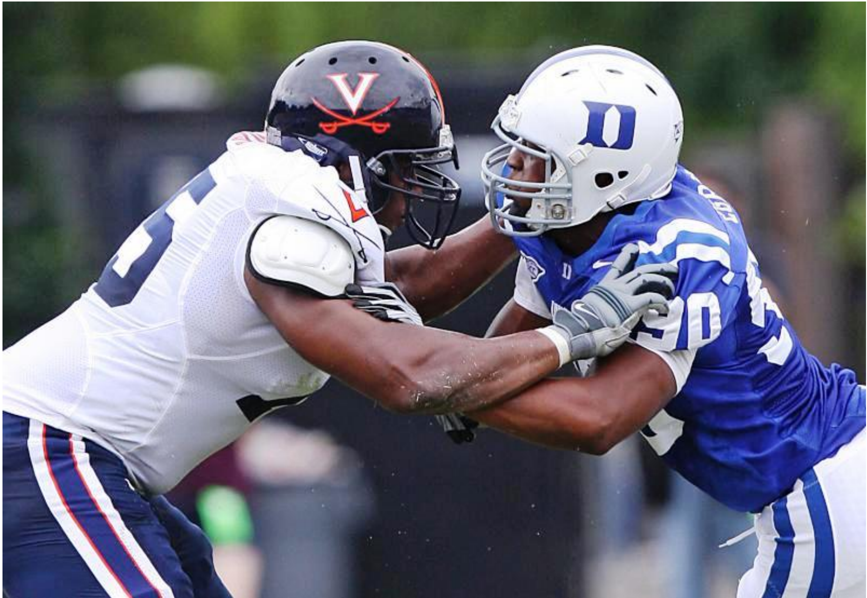
Blue Pants, Fig. 2: Side view