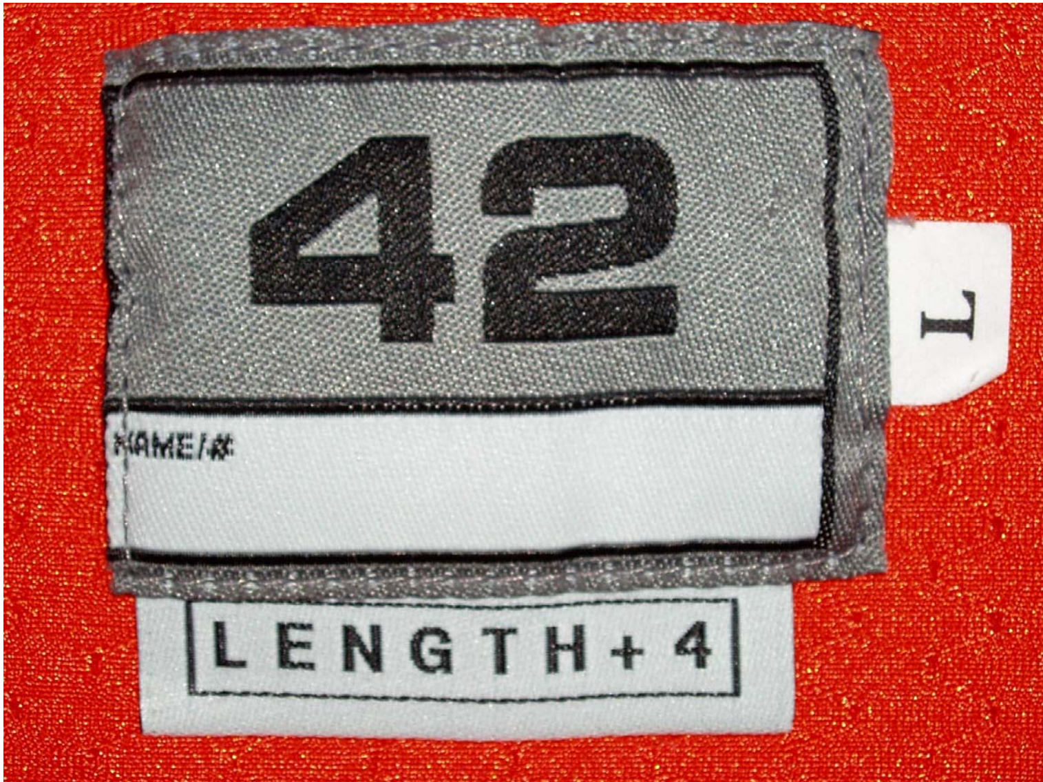
Throwback Jersey, Fig. 4: Size tag